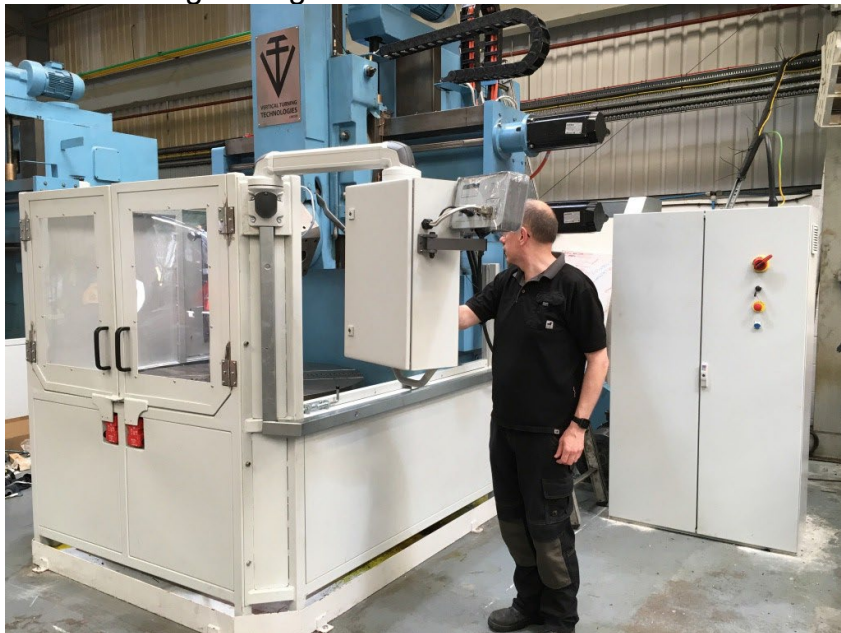
2017 - Hybrid - Great operator manual and CNC capabilities