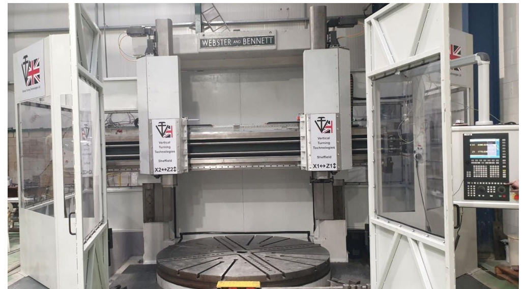
2020 – a 50 year old DC120 becomes a full CNC 3m machine