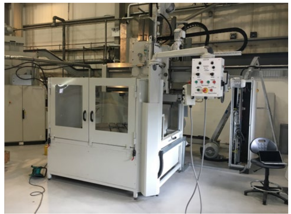
2016 – another with pendant controlled power swivel to the ram