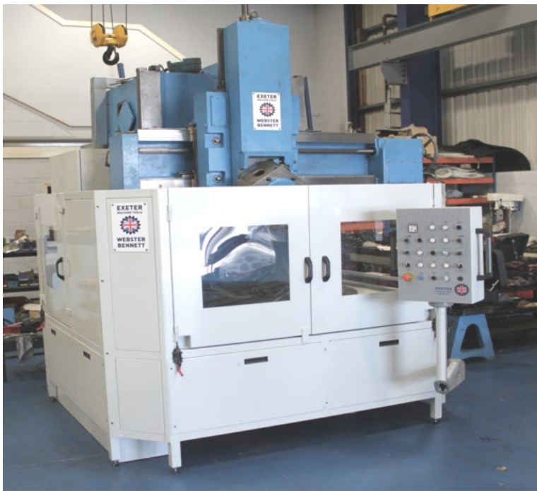
2010 - The first machine with table speed control during cutting. This user's 3 rd machine