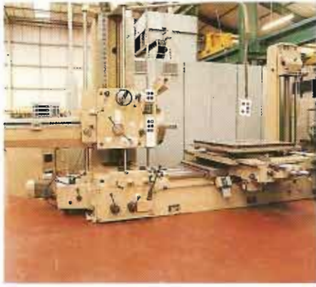
UNION BFT80/11 HORIZONTAL BORER - 1982