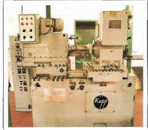
KOPP EKF12 CAM MILL