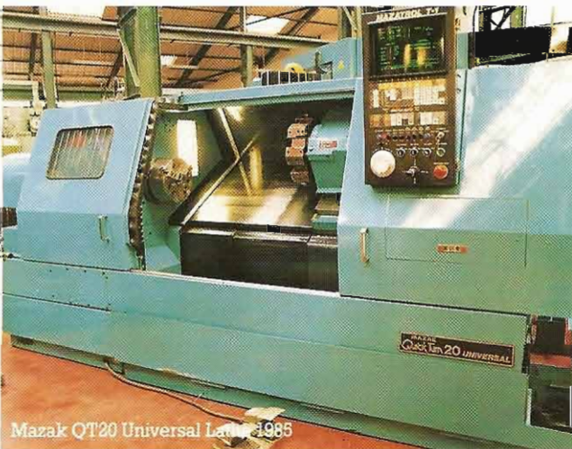
Mazak QT20 Universal Lathe 1985