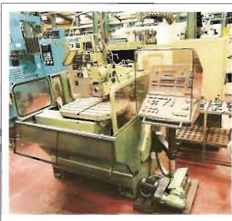
DECKEL FP41 CNC TOOLROOM MILL - 1980