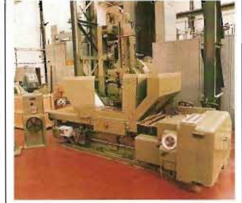
NILES Z STZ800 GEAR GRINDER