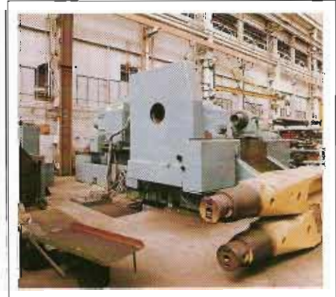
SUNDERLAND GEAR PLANER 2950mm DIA. - SPUR & DOUBLE HELICAL - 1978