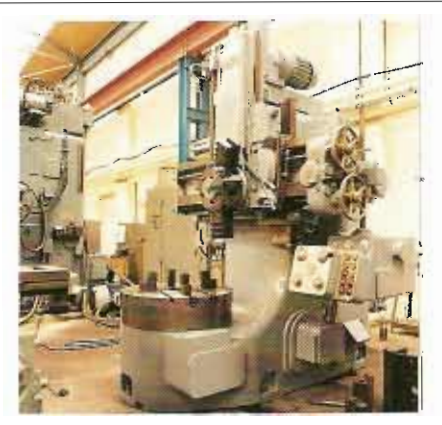
WEBSTER & BENNETT 36EM VERTICAL BORER