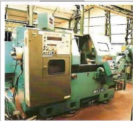
MAZAK 3L UNIVERSAL CNC LATHE – 1979