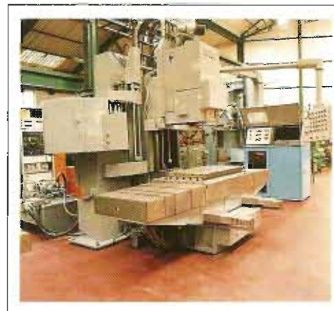
CINCINNATI 10VC 1000 CNC MACHINING CENTRE - 1979