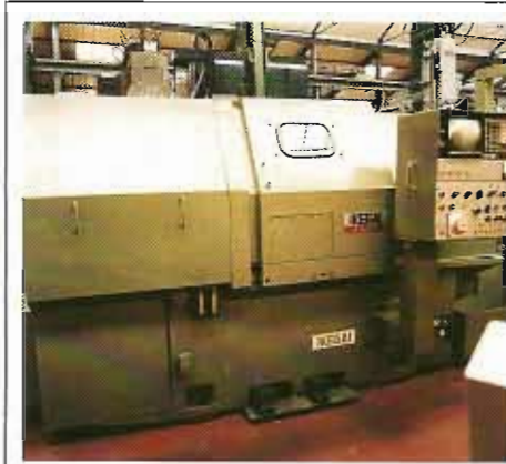
IKEGAI AX20 CNC LATHE – 1982