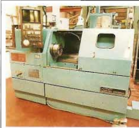
MAZAK QUICKTURN 10 BARFEED CNC LATHE – 1983