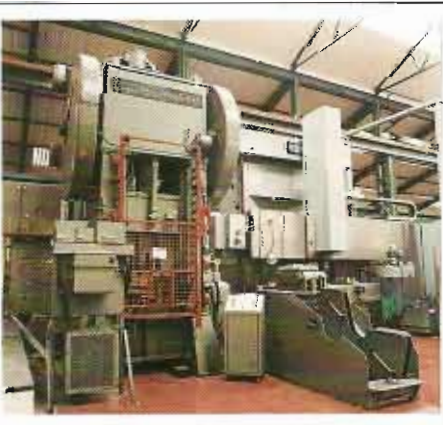
HME SI200 30-36 PRESS