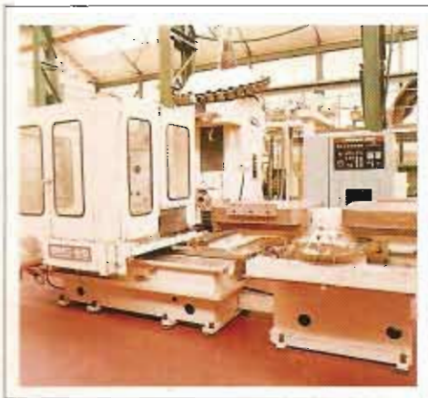
TOSHIBA SHIBAURA BMC-B8 CNC MACHINING CENTRE - 1980