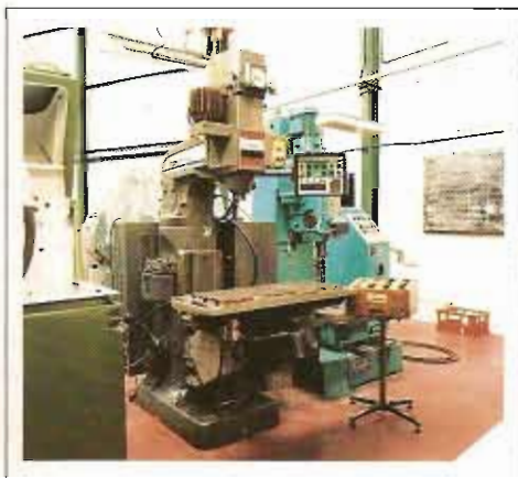
BRIDGEPORT SERIES I CNC TURRET MILL - 1980