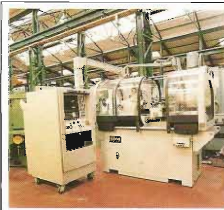
HARDINGE CNC PRECISION LATHE & BARFEED