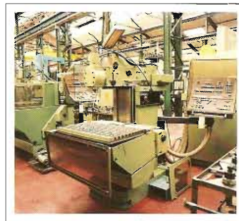
DECKEL FP4 CNC TOOLROOM MILL - 1980