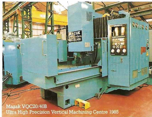
Mazak VQC20/40B Ultra High Precision Vertical Machining Centre 1985