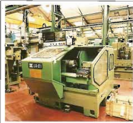
WASINO LG81 CNC LATHE & MILLING – 1982