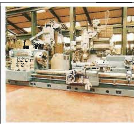
TUDA 14" SPINDLE, TWIN CHUCK OIL COUNTRY LATHE – UNUSED

DO YOU HAVE MACHINES OR PRODUCTION LINES FOR SALE? ANY QUANTITY – PLEASE CONTACT US NOW