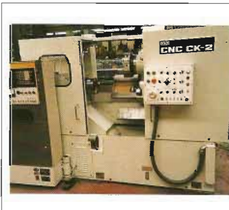
YAM CK2 CNC LATHE & BARFEED – 1980