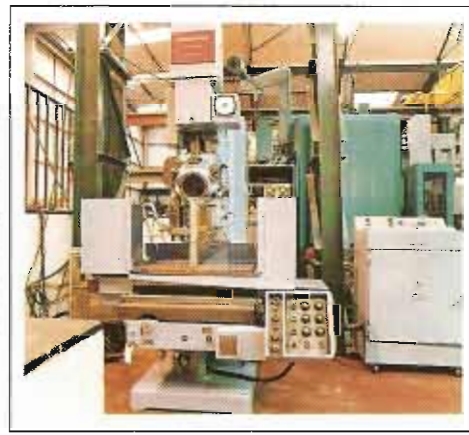
HERBERT COORDATROL NC TURRET DRILL