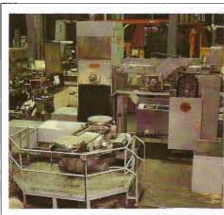
SUNDSTRAND CNC MACHINING CENTRE