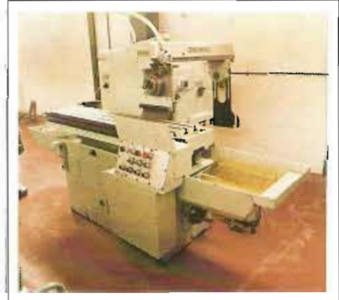
CINCINNATI 100 POWERMATIC - 1973