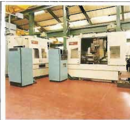
DSG MONARCH TC1 CNC LATHE & BARFEED – 1979