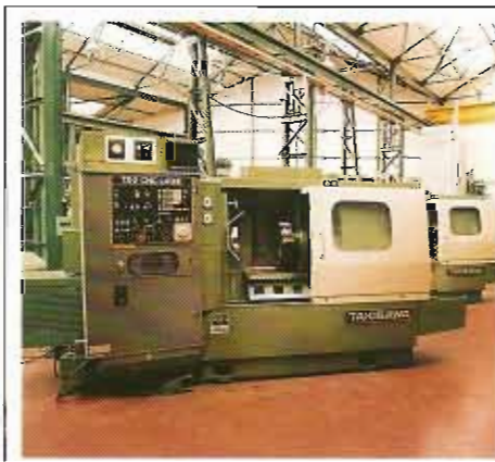
TAKISAWA TX2 CNC LATHE – 1982