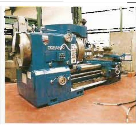
MORANDO 16" SPINDLE, TWIN CHUCK OIL COUNTRY LATHE – 1973