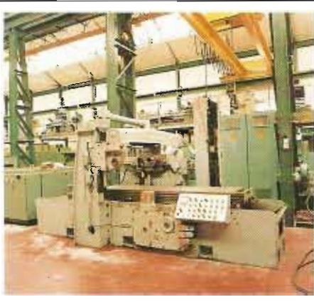
CINCINNATI 400 HYPOWOMATIC - 1971