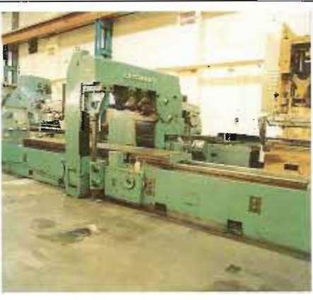
CINCINNATI 500 HYPOWOMATIC - 1970