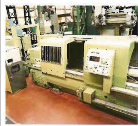
MORI SEIKI TL5 2000mm CNC LATHE – 'AS NEW'