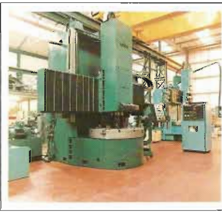
UTITA TV1500/2 CNC VERTICAL BORER 12 STATION ATC - 1982