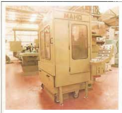
MAHO MH500 CNC MACHINING CENTRE - 1981