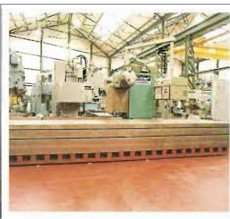
BUTLER ELGAMILL DR12VA CNC BED TYPE MILL - 1979