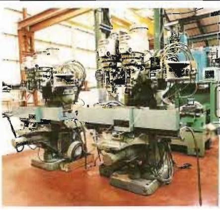
BRIDGEPORT 3DA 360° TWIN HEAD COPY MILLS