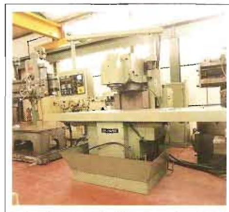
ELLIOTT MILMATIC 400 UNIVERSAL MILL WITH MPS CNC