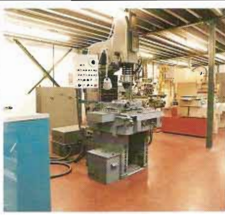
HAUSER 3SMO OPTICAL JIG GRINDER