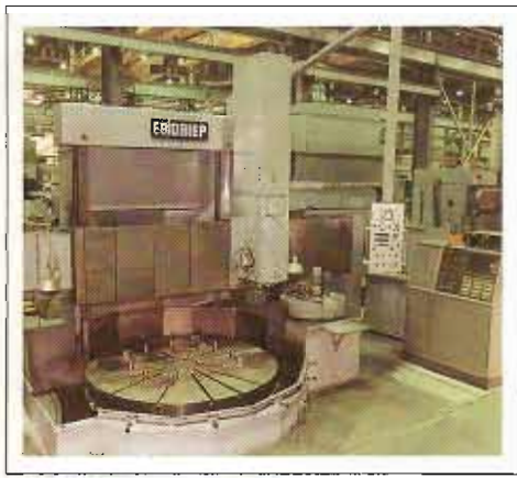
FRORIEP 2.2m VERTICAL BORER WITH 12 STATION ATC