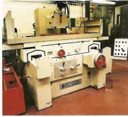
MICROSTATIC RT80-40 SURFACE GRINDER 32" x 16" - 1980