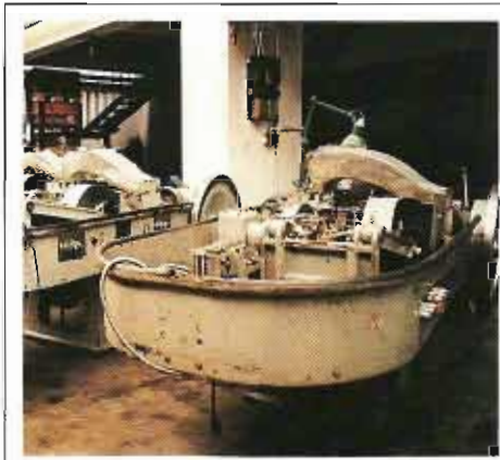
HEENAN & FROUDE WIRE & STRIP FORMERS