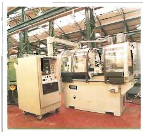
HARDINGE CNC PRECISION LATHE & BARFEED