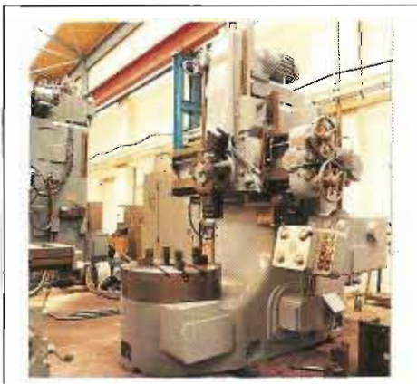
WEBSTER & BENNETT 36EM VERTICAL BORER