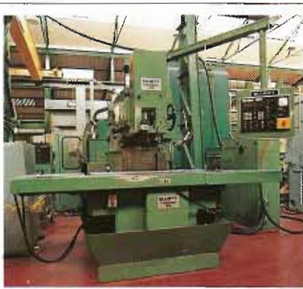
ELLIOTT STURDIMATIC 400 CNC MILL