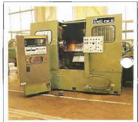
YAM CK5 CNC LATHE - 1983