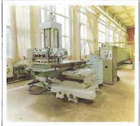
SECMU C6 3 AXIS UNIVERSAL BED TYPE MILL