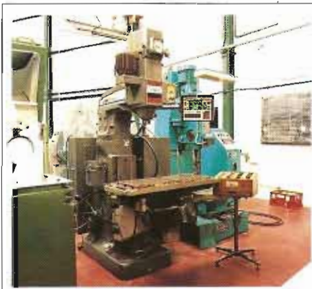
BRIDGEPORT SERIES I CNC TURRET MILL - 1980