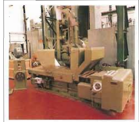
NILES Z STZ800 GEAR GRINDER