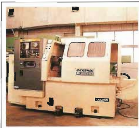
DAEWOO PUMA 10 CNC LATHE - 1983