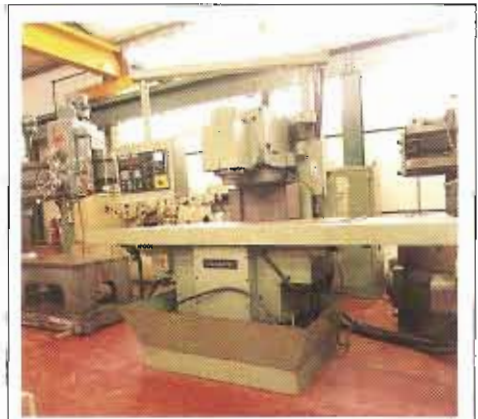
ELLIOTT MILMATIC 400 UNIVERSAL MILL WITH MPS CNC