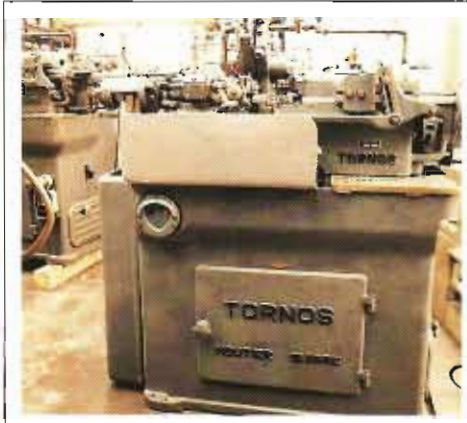
TORNOS R10 & M7 SWISS AUTOS