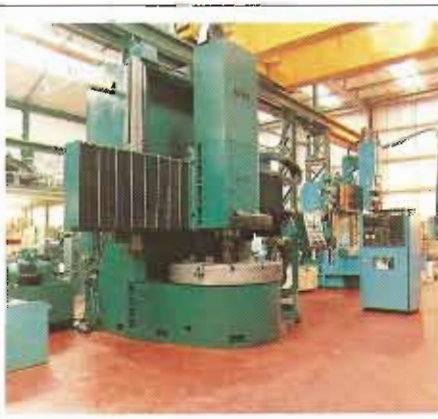
UTTITA TV1500/2 CNC VERTICAL BORER 12 STATION ATC - 1982