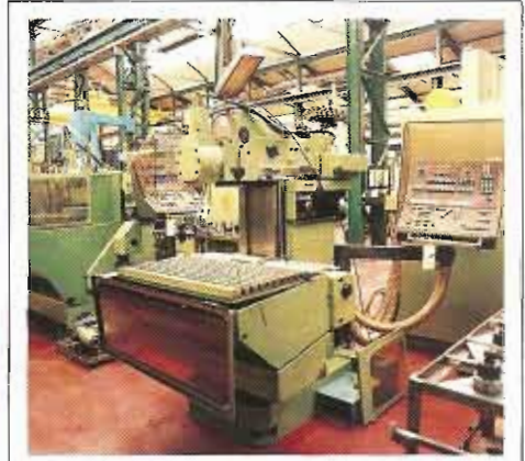
DECKEL FP4 CNC TOOLROOM MILL - 1980