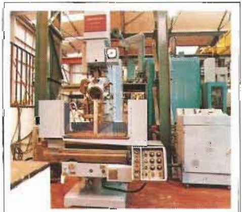
HERBERT COORDATROL NC TURRET DRILL