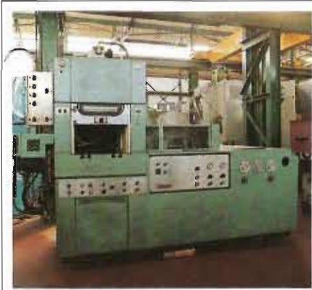
FINE BLANKING PRESS - 150 TON