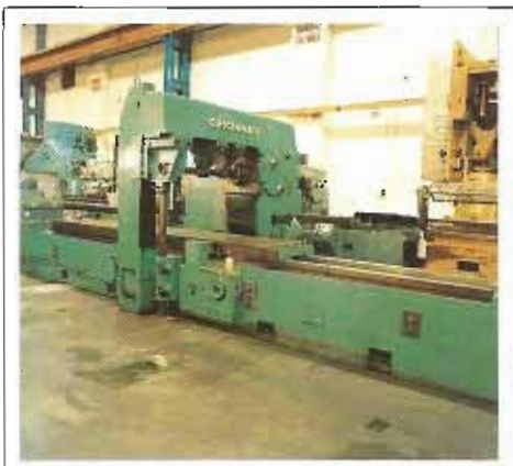
CINCINNATI 500 HYPOWERMATIC - 1970