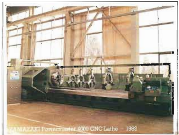
YAMAZAKI Powermatic 4000 CNC Lathe – 1982

WICKMAN MULTI SPINDLE AUTOS and WEBSTER BENNETT VERTICAL TURRET LATHES – you can now buy these machines secondhand, with factory back-up, from WICKMAN EXETER who operate from the same site as the manufacturers. Also factory rebuilt machines available. Send for full details.