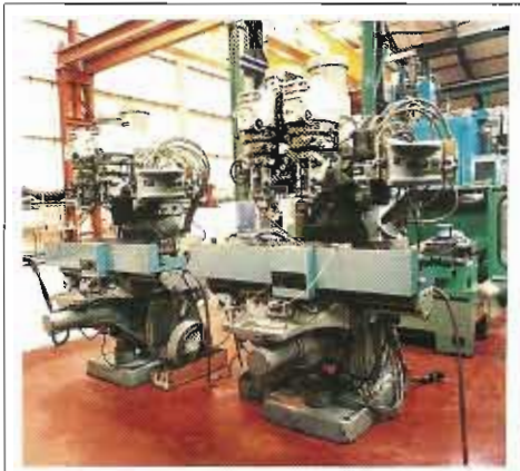
BRIDGEPORT 3DA 360° TWIN HEAD COPY MILLS