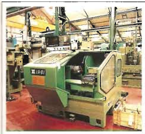
WASINO LG81 CNC LATHE & MILLING - 1982

Programming - Tooling - Operator Training - Commissioning - Guaranteed Back-up - Used CNC Machines of the highest quality.