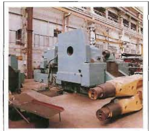
SUNDERLAND GEAR PLANER 2950mm DIA. - SPUR & DOUBLE HELICAL - 1978