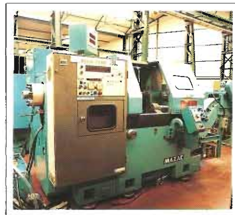
MAZAK 3L UNIVERSAL CNC LATHE - 1979