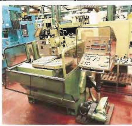
DECKEL FP41 CNC TOOLROOM MILL - 1980