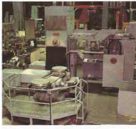
SUNDSTRAND CNC MACHINING CENTRE