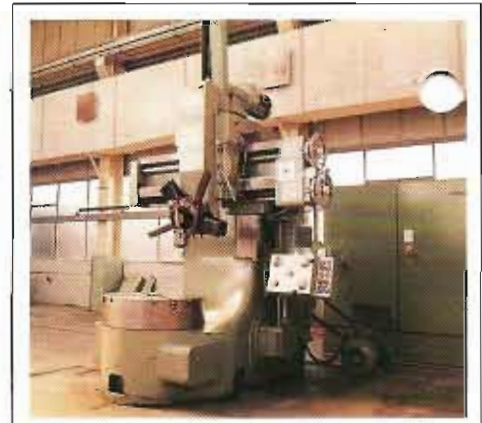
WEBSTER & BENNETT 36EV - 1980