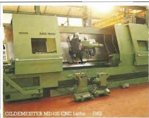
GILDEMEISTER MD 10S CNC Lathe – 1982

Full details of these and other machines currently in stock available on request.