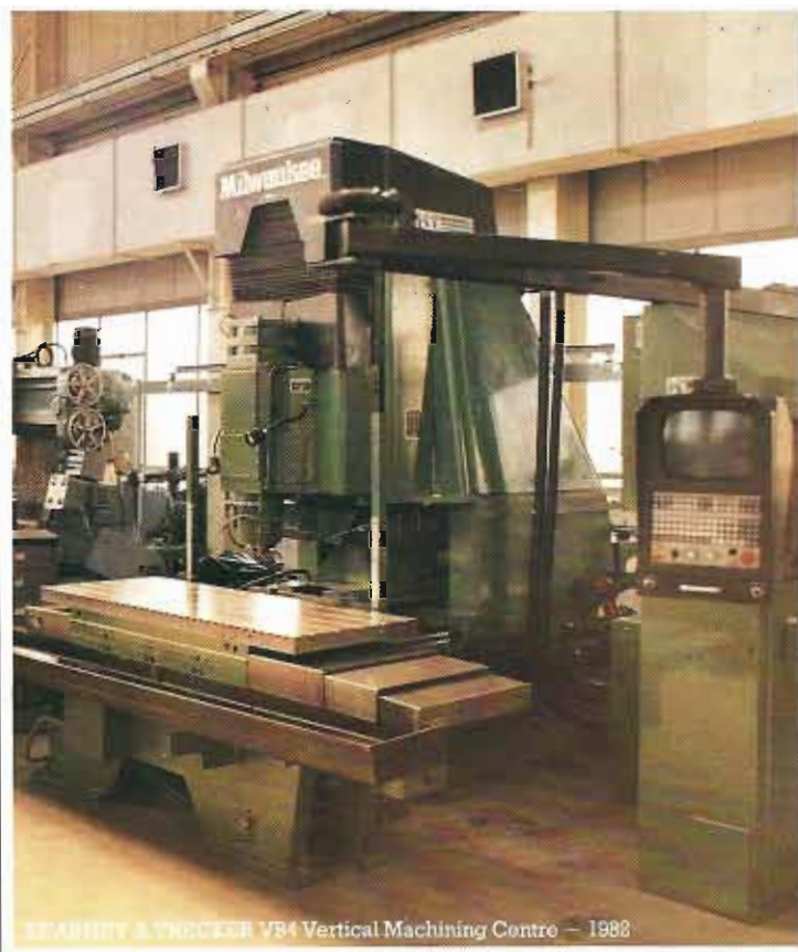
SEABRIGHT & TRECKER VB4 Vertical Machining Centre – 1982

We are now located at the main WICKMAN BENNETT site in Coventry – 10 minutes from BIRMINGHAM INTERNATIONAL AIRPORT 10 minutes from THE NATIONAL EXHIBITION CENTRE 10 minutes from COVENTRY or BIRMINGHAM INTERNATIONAL RAIL STATIONS 3 minutes from the main A45 directly linking to M1, M45, M5, M6 and M42.