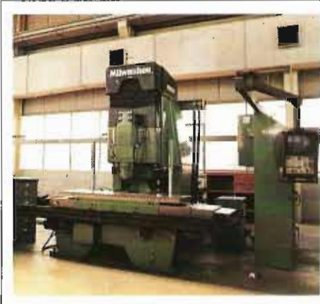
KEARNEY & TRECKER VB4 MACHINING CENTRE - 1982