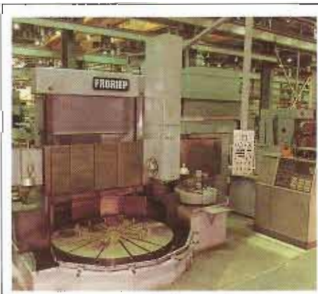
FRORIEP 2.2m VERTICAL BORER WITH 12 STATION ATC