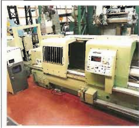
MORI SEIKI TL5 2000mm CNC LATHE