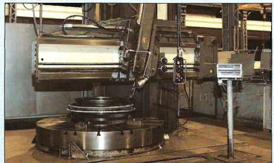
BERTHIEZ BM 225 OPENSIDE VERTICAL BORER. Rétractable Table 2250 mm diameter. SWING 4500 mm. Maximum height 200 mm. 1-100 rpm. PENDANT.

BOSCH 800 N.C. Continuous Path. NEW 1973. EXCELLENT + similar 1971 machine also available.