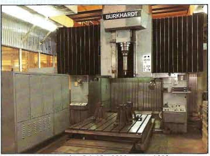
BURKHARDT JIG BORER. 2500 mm x 1850 mm. 2500 mm between columns. Accepts 17 tons on table. 1969 — MAGNIFICENT — £35,000.

BURKHARDT JIG BORER. 1200 mm x 1050 mm. OPEN FRONTED MACHINE. 1970. £9,500.