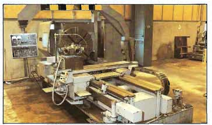
AMERICAN 5035 NC lathe - 1970 - £14,500

BURKHARDT JIG BORER. 1200 mm x 1050 mm. OPEN FRONTED MACHINE. 1970. £9,500.