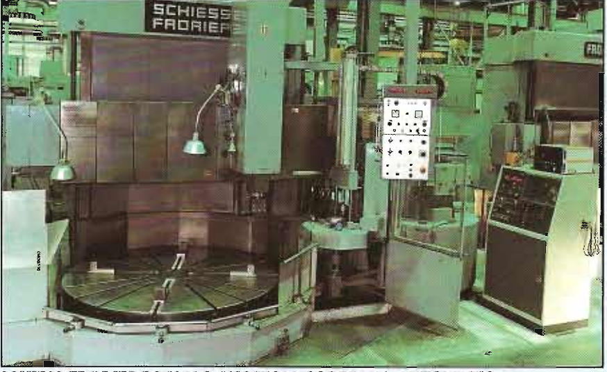
SCHIESS FRORIEP DS 20 N.C. VERTICAL BORER with AUTOMATIC TOOLCHANGER -32 station.

ASEA NUCON 312 Continuous Path Numerical Control. NEW 1974. EXCELLENT. At a fraction of replacement cost.