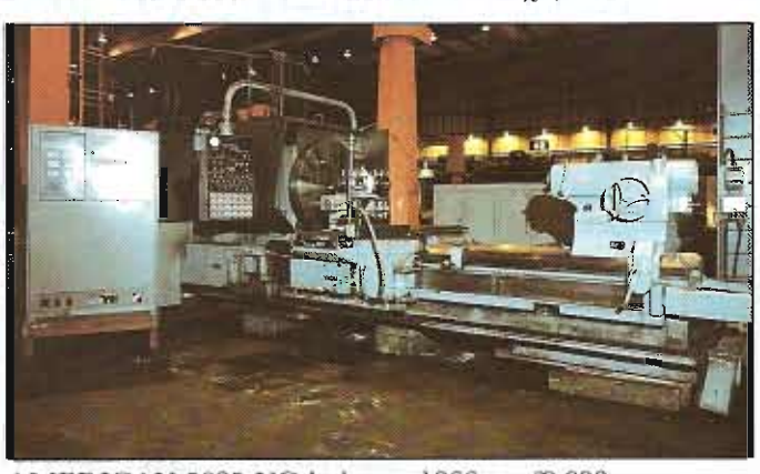
AMERICAN 5035 NC lathe — 1966 — £9,000.