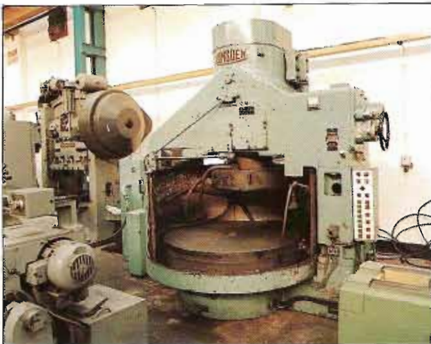
LUMSDEN 93ML 60" dia mag chuck

Model M500 Dual (Roughing and Finishing heads). Conveyor loading and unloading. 1974 – in excellent condition.