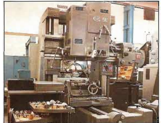
SIP5 JIG BORER. Full tooling. TILTING ROTARY TABLE. Superb. £27,000.