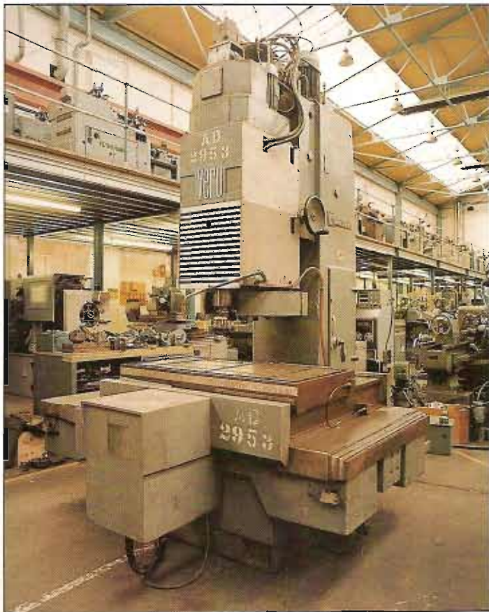
VERO 2000 MACHINING CENTRE 20 STATION TOOLCHANGER. X.7 1170mm × 610mm

CINCINNATI MILACRON C.N.C. TURNING & MACHINING CENTRES YOU CAN BUY THESE NEW MACHINES directly through agents EXETER MACHINE TOOLS and enjoy the benefit of part exchange allowances on N.C. or standard machines.