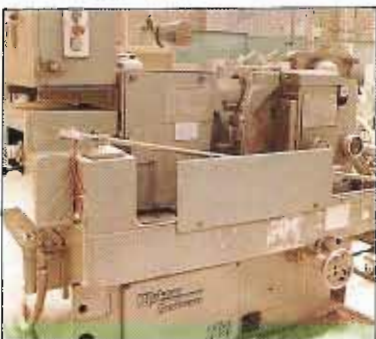
WICKMAN SCRIVENER No 1