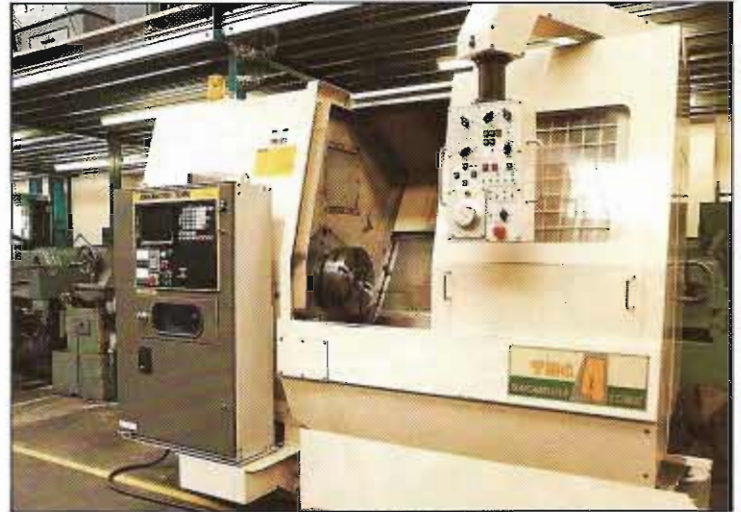
NAKAMURA TMC 4 CNC LATHE 1981 — AS NEW. £39,000.