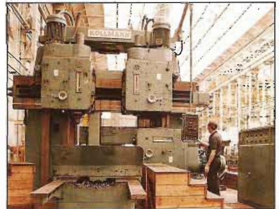
KOLLMAN MCS 63 PLANO MILL 168 in. x 67 x 67. 3 SWIVEL HEADS. RIGHT ANGLE HEAD. 1959/79. £39,750.

SEND FOR FULL LIST — OFFER US YOUR SURPLUS MACHINES