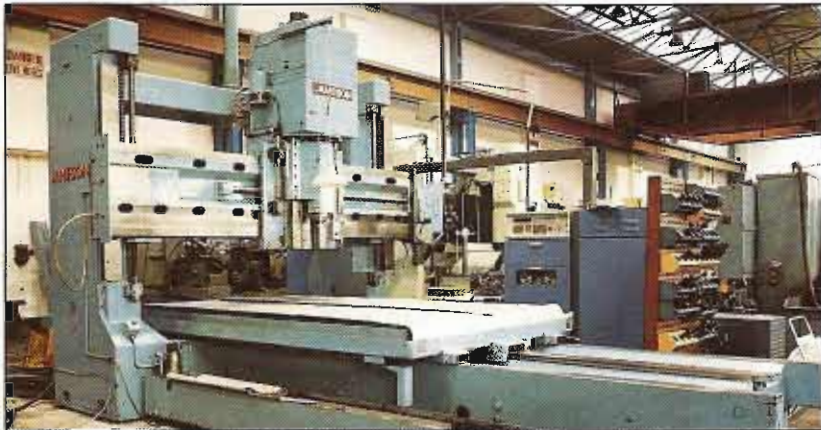
JAMESON F487 Double Column Vertical Drilling, Milling and Boring Machine. Table 126 in. x 66 in. 31-1808 r.p.m. 1978. DATASAAB MTC9 control. £35,000.