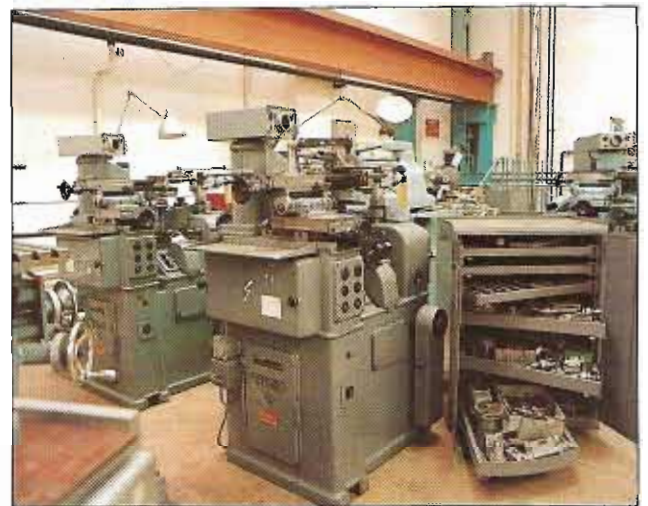
STUDER PSM 150 PROFILE GRINDERS