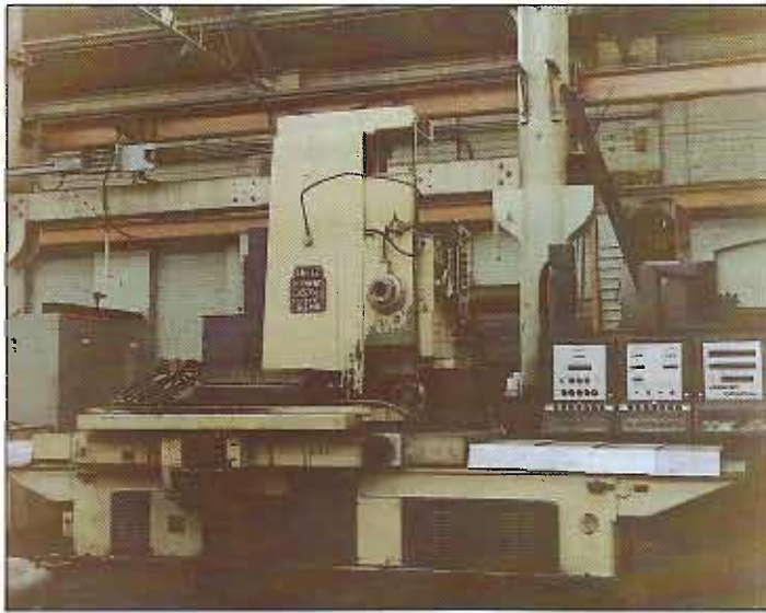
HERBERT DE Vlieg 4K-72 N.C. Precision Boring & Milling Machine. 1974 – excellent condition. With existing DATAROL 3 N.C. system – £45,000. Reprecisioned and fitted new DIATROL V C.N.C. (by De Vlieg) or other C.N.C. system to choice and equipped with selection of superb indexing tables and angle plates – £92,000.