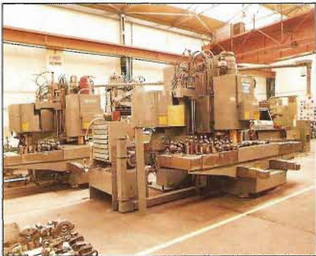
CINCINNATI 10VC 1250 MACHINING CENTRE. 1981 — AS NEW. £49,000.