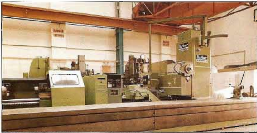
BUTLER ELGAMILL 10m bed 24h.p. DC spindle MPS — Microprocessor Control. Superb. 1980. £76,000.

FROM A WIDE SELECTION OF STANDARD & CNC MACHINES — IN STOCK