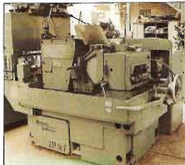
WICKMAN SCRIVENER 2J