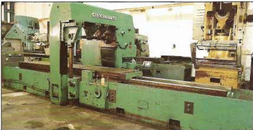
CINCINNATI 500 Series HYPOWERMATIC. 1970. 144 in. x 26 in. table. Extra height. Excellent. £23,500.