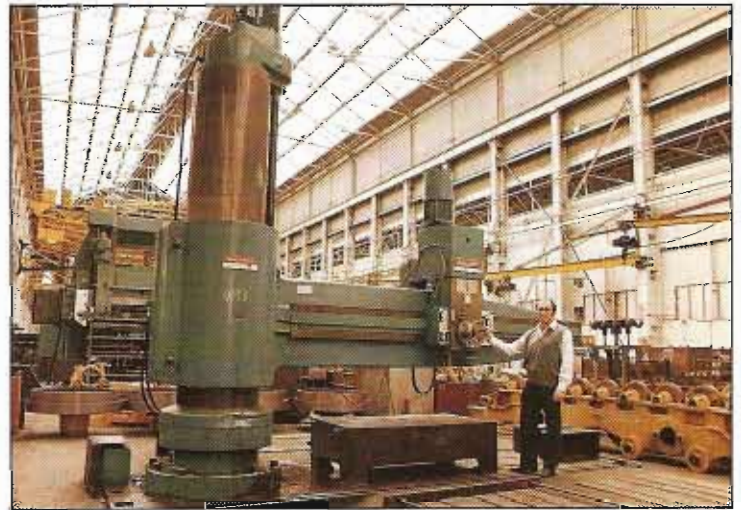
ASQUITH 14ft RADIAL DRILL 1978 — PERFECT. £22,500.

We have a superb stock of Standard and CNC machine tools.