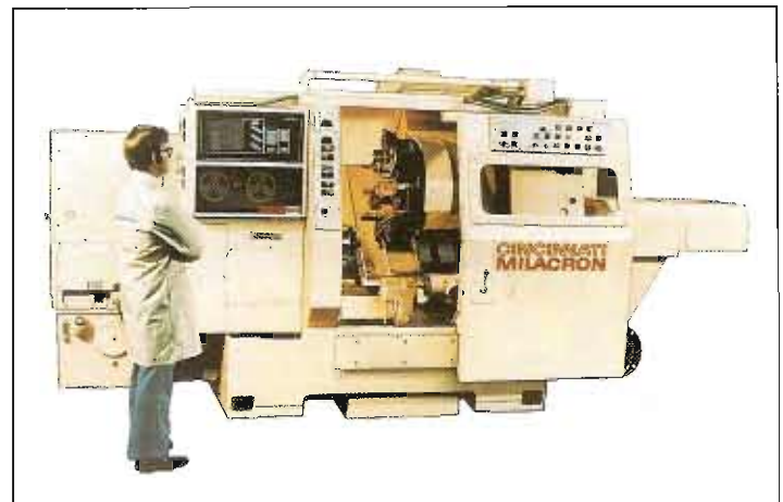
CINTURN Series C TURNING CENTRE Model 10CV shown with optional swing-up tailstock. 70D & 71D tools positions. 30 hp main motor. 30-3000 rpm. 10" dia chuck (12" models available). ACCRAMATIC 900TC machine mounted C.N.C. Very good value. Send for quotation.