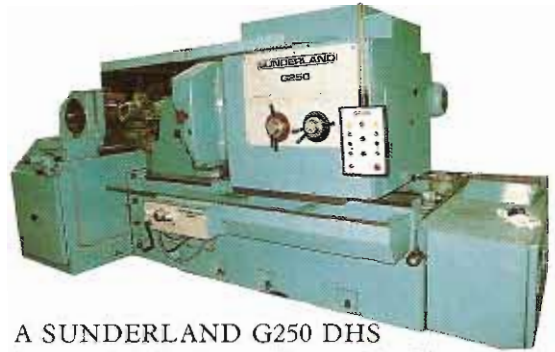
A SUNDERLAND G250 DHS Spur and helical Gear Planer. Double Cutting. Capacity — 102 in. diameter — 20 in. face width. New 1978 — fully equipped — PERFECT. £145,000.