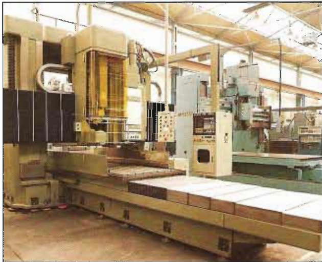
OKUMA CNC MACHINING CENTRE 1982 — AS NEW. £160,000.